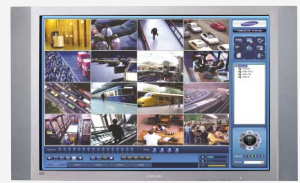
16 Channel Display